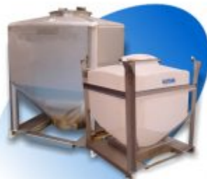
Intermediate Bulk Containers (IBCs)