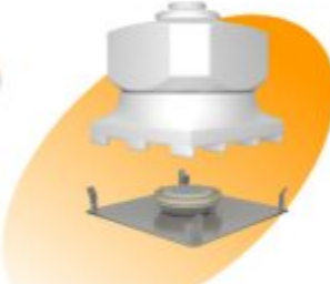
Bulk Tablet IBC and Tablet Discharge Stations