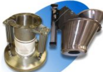
IBC Filling Systems