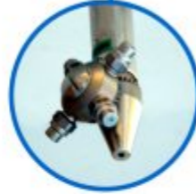
Internal Spray Nozzle