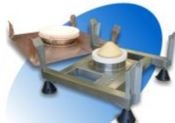
IBC Discharge Stations