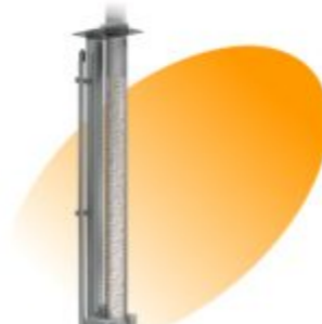
Gentle Transfer Chute (GTC)