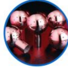
Multiple External Spray Nozzles