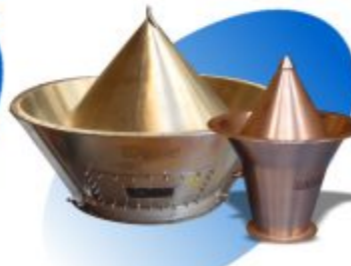
Silo / hopper Discharger Valves