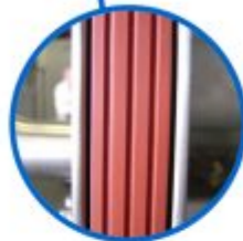
Inflatable Door Seal